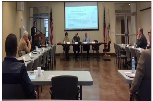
NWGRC Council Meeting, Regional Plan Update February 2019

In Fall 2018, the Northwest Georgia Regional Commission Council began the update process for the Regional Plan. The NWGRC Council served as the Steering Committee, which prepared the Regional Plan with input from the Technical Advisory Committee of Council members and NWGRC staff, invited stakeholders, and members of the public through a public planning process. In Spring 2019, the What Northwest Georgia Needs Most? Regional Survey garnered 1,860 responses