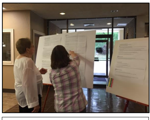
2017 Fannin Comprehensive Plan Open House