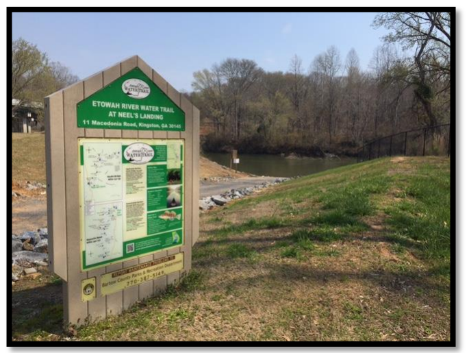
Etowah River Water Trail, Bartow County.

This annual update to the 2014 Northwest Georgia Regional Agenda has been prepared in accordance with the Standards and Procedures for Regional