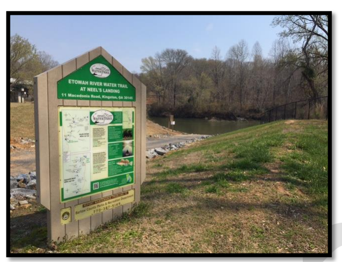
Etowah River Water Trail, Bartow County.