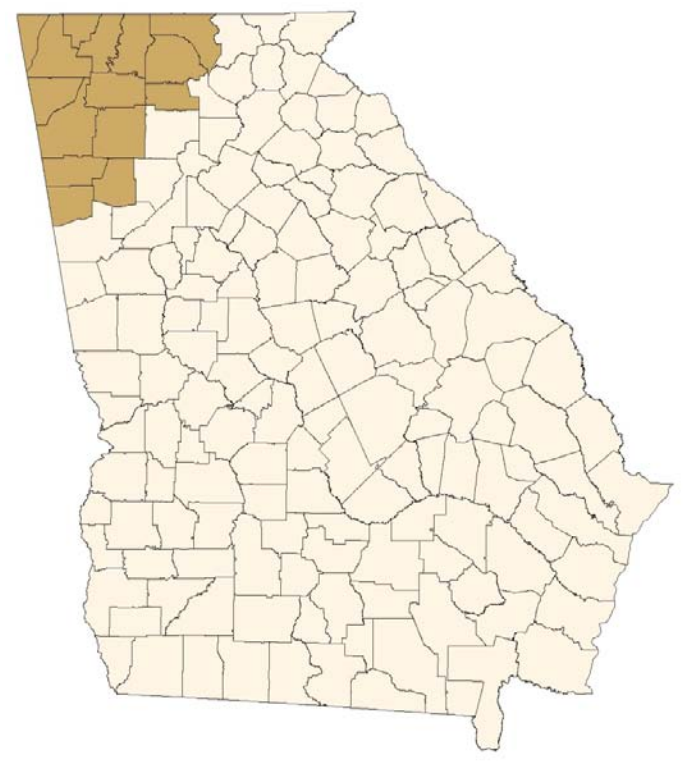
A Region with a Bright Future