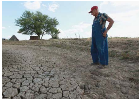
“Stuck With the Farm” Farmer