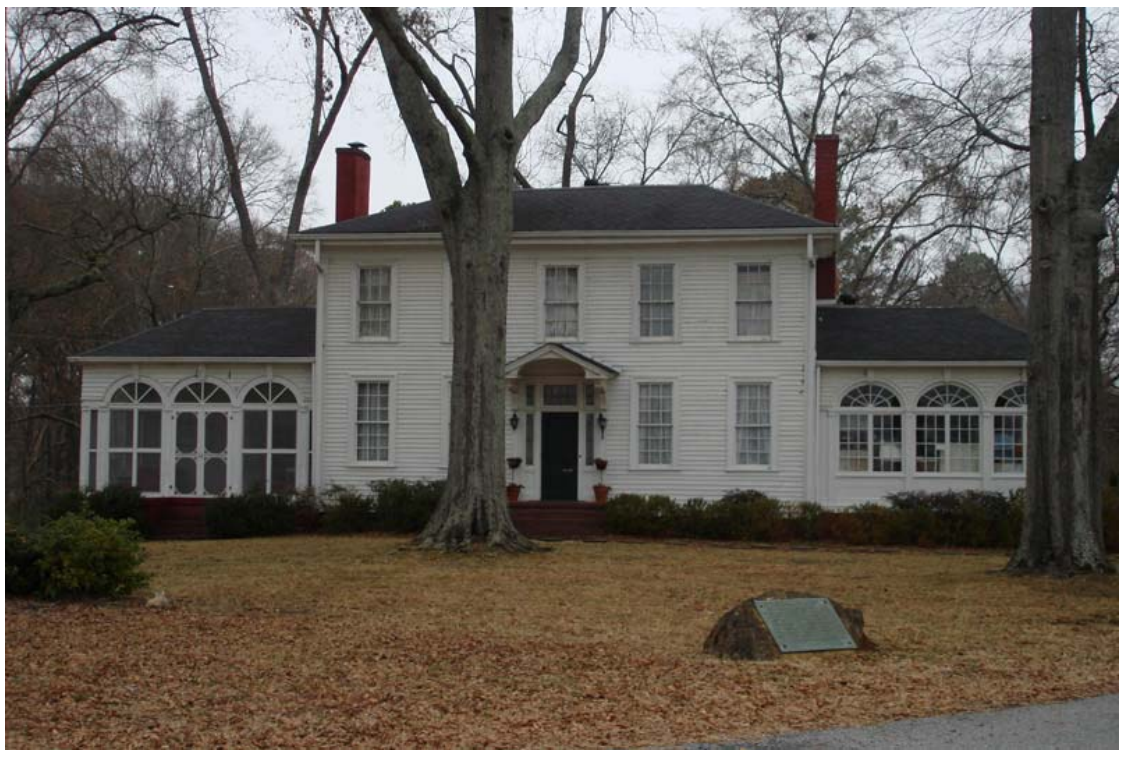
Chieftains Museum/Major Ridge Home