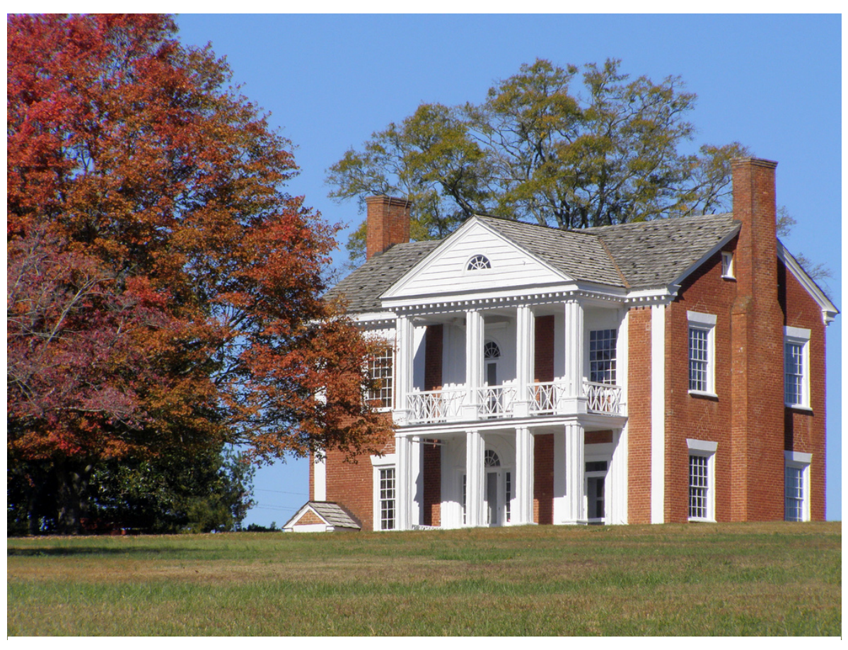
The Vann House