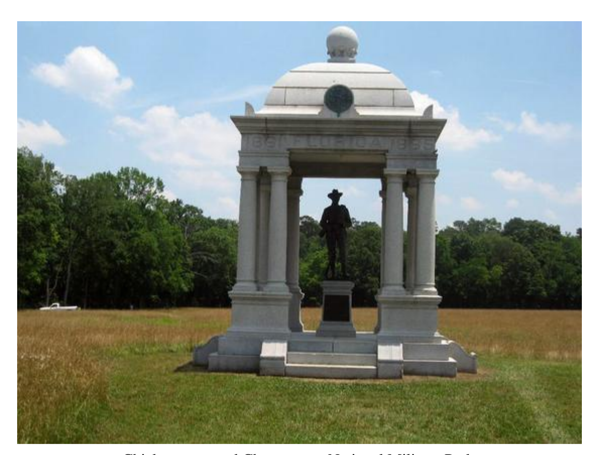
Chickamauga and Chattanooga National Military Park

The Northwest Georgia Region preserves evidences of two Civil War military campaigns, the Chickamauga Campaign in the far north and northwest of the Region, and the Atlanta Campaign in a swath roughly following the old Western and Atlantic Railroad from Catoosa County to the southeast corner of Bartow County. (See Map 28.)