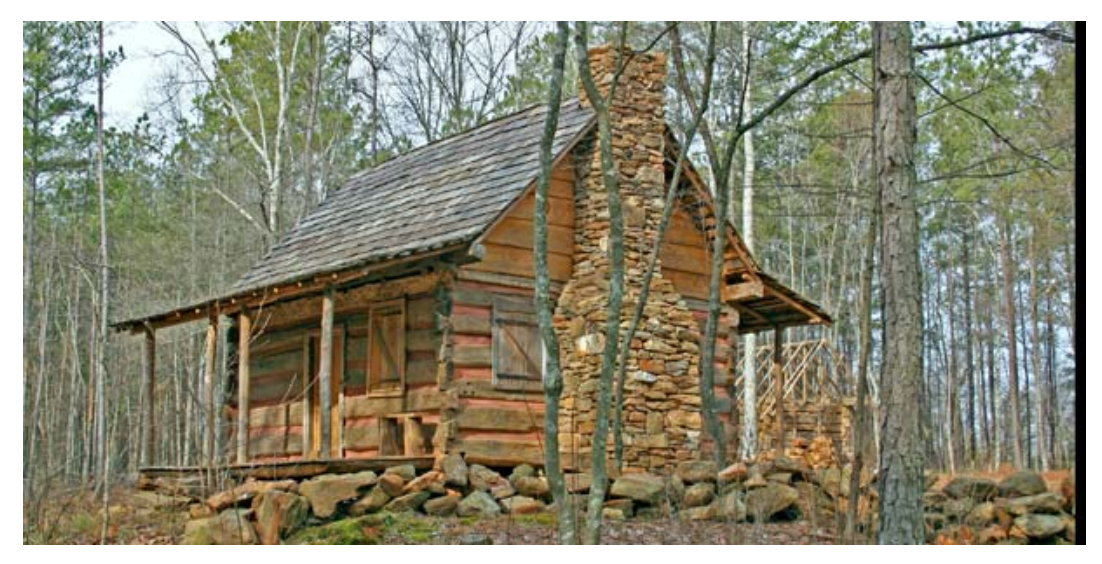
Picketts Mill Battlefield

The Chickamauga and Chattanooga National Military Park and Pickett's Mill Battlefield Site are listed in the National Register of Historic Places. In addition, much of the Davis' Crossroads battlefield area lies within the McLemore Cove Historic District.