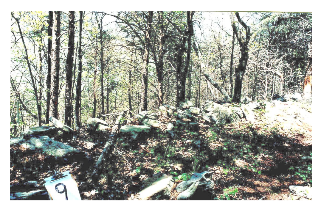
Rocky Face Ridge

Allatoona , October 5, 1864. Bartow County. Major battle. Good integrity. Threat moderate.