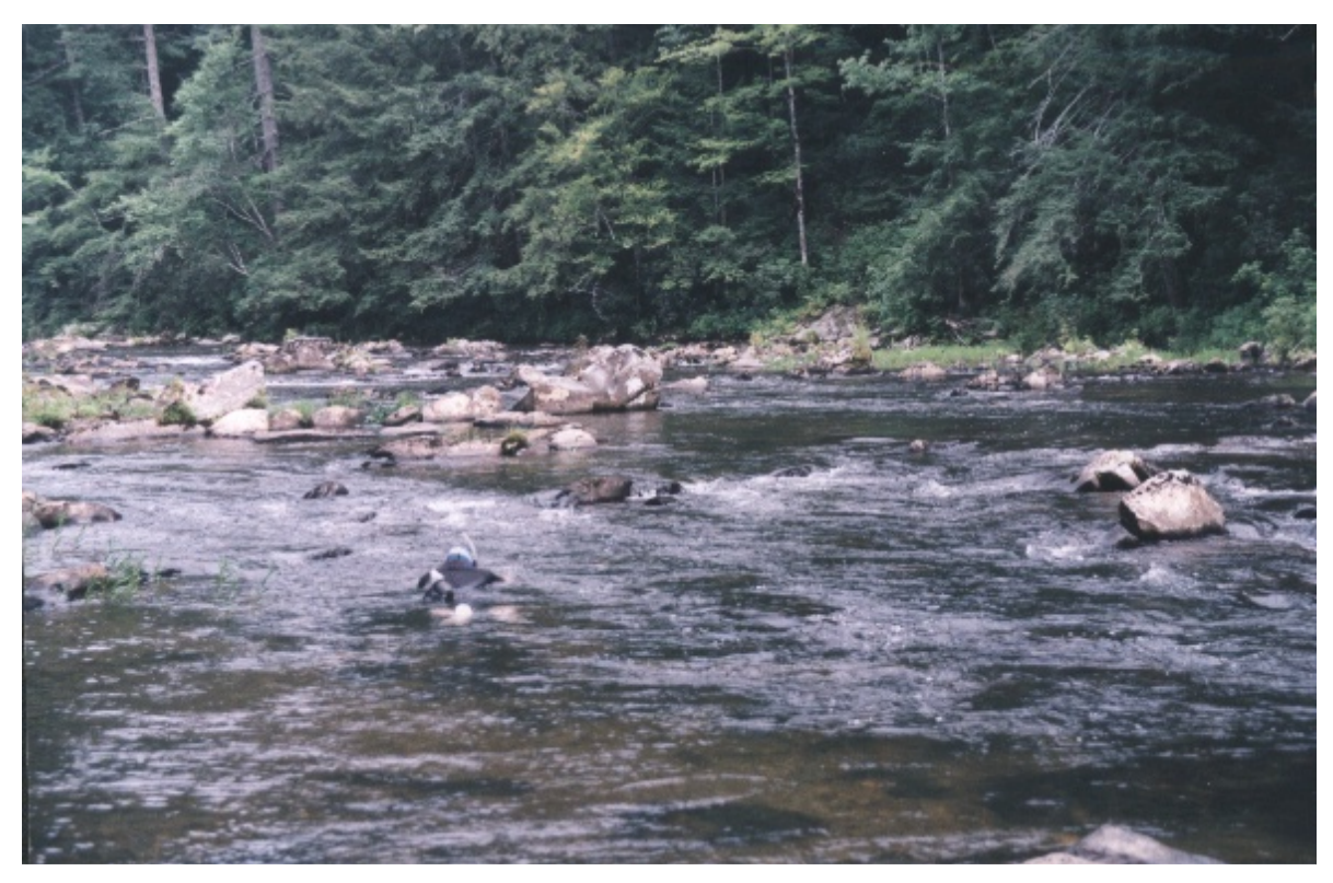
The Conasauga River