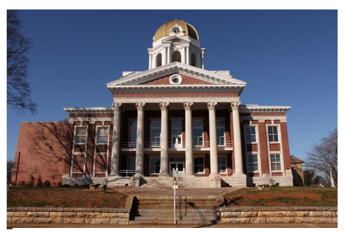
Bartow County Courthouse

Benham Place -- Unique, excellent example of a mid-nineteenth-century, one-and-one-half story brick Georgian cottage with Gothic Revival stylistic elements, rebuilt after the Civil War in c. 1865-67 using much of the foundation and walls of an earlier two-story house.